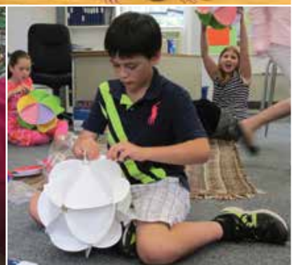
Top row: The sixth graders study ancient Greece and then participate in a Greek Olympics in physical education class. Sixth-grade student enjoys the potato sack race at the Family Picnic. Above: A science student photographs lady's slippers in the wild. Sixth graders construct icosahedrons in math class. Beautiful Hewes Brook runs through Crossroads Academy's 140-acre campus.

curriculum has since been adopted by many schools across the nation. Crossroads teachers use stories, discussion, and service projects to highlight and reinforce these virtues.