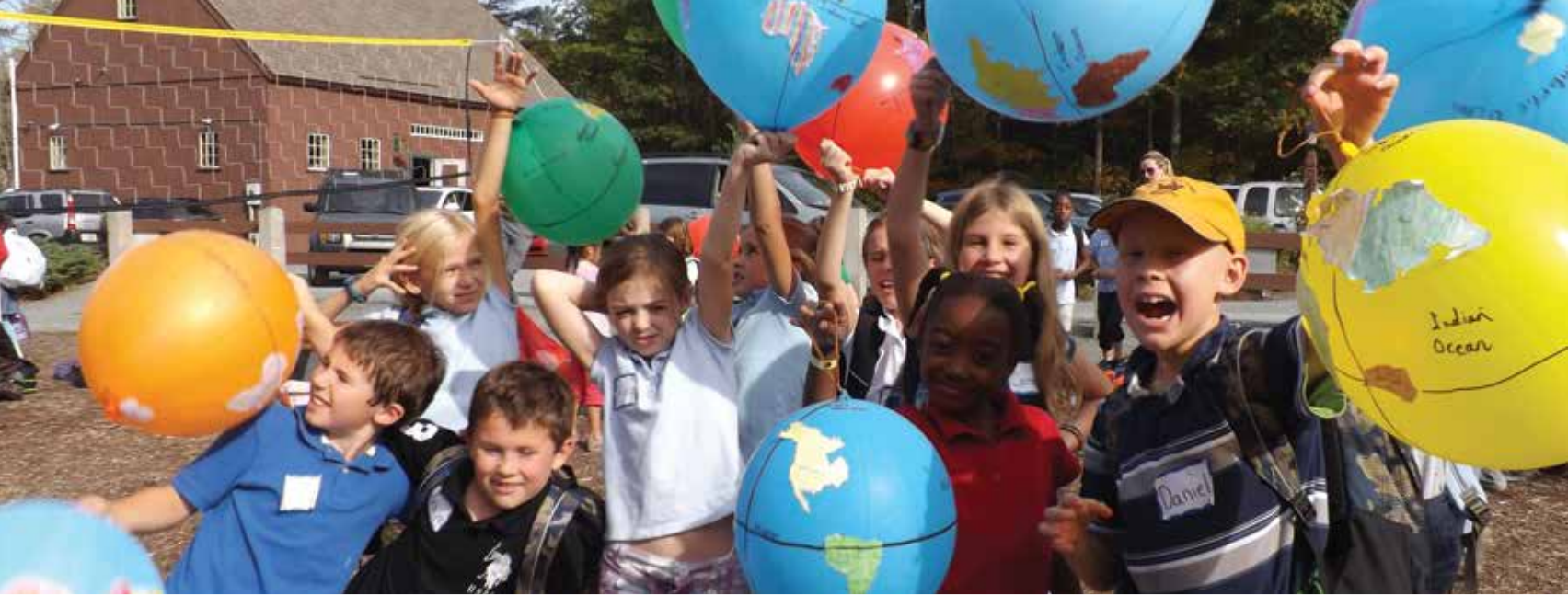
Clockwise from above: Third-grade students show off their balloon globes. Faculty celebrate their 100 percent giving for the Annual Fund. First-grade classmates. Second-grade parent, teacher, and assistant celebrate the end of the ancient India unit. First-grade students enjoy the Family Square Dance. Eighth-grade student sets the height for the new greenhouse. First-grade habitat project.

“The more students know, the more resources they have to think with, the more interested they become in learning still more, and the more articulate and insightful they become as speakers and writers.”