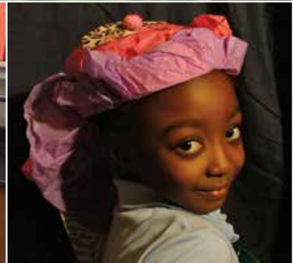
Top row: Recess break for two second graders and a third grader. Eighth-grade students work on the greenhouse for the lady's slipper restoration project. Above: Science students prepare lady's slippers for vernalization. A third-grade student models her original hat in the style of Jan Vermeer. Klee Building houses K-5 students and a state-of-the-art science lab.

aspect of understanding poetic and classical rhetoric.