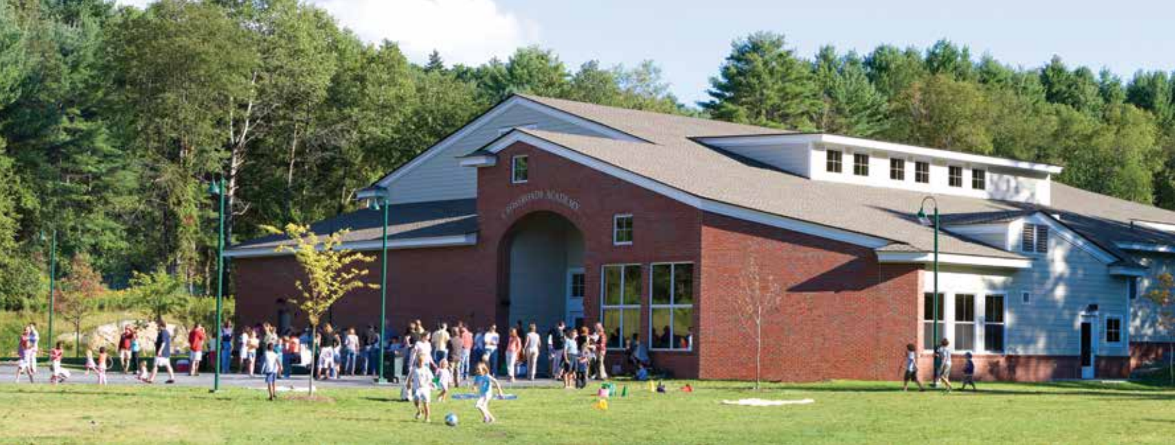
Clockwise from above: Bancroft Campus Center houses the library, art room, music room, and the gymnasium/performing arts center. A scene from last year's middle school musical, The Little Mermaid. First-grade student reading. Kindergarten students having fun on the cargo net during recess.